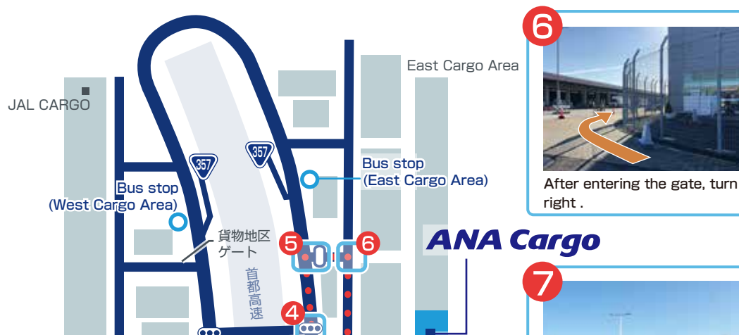
West Cargo Area Bus stop (Airport 空港連絡通路 Police Office) (環状8号線へ) Bus stop(In front of Haneda Airport Office)